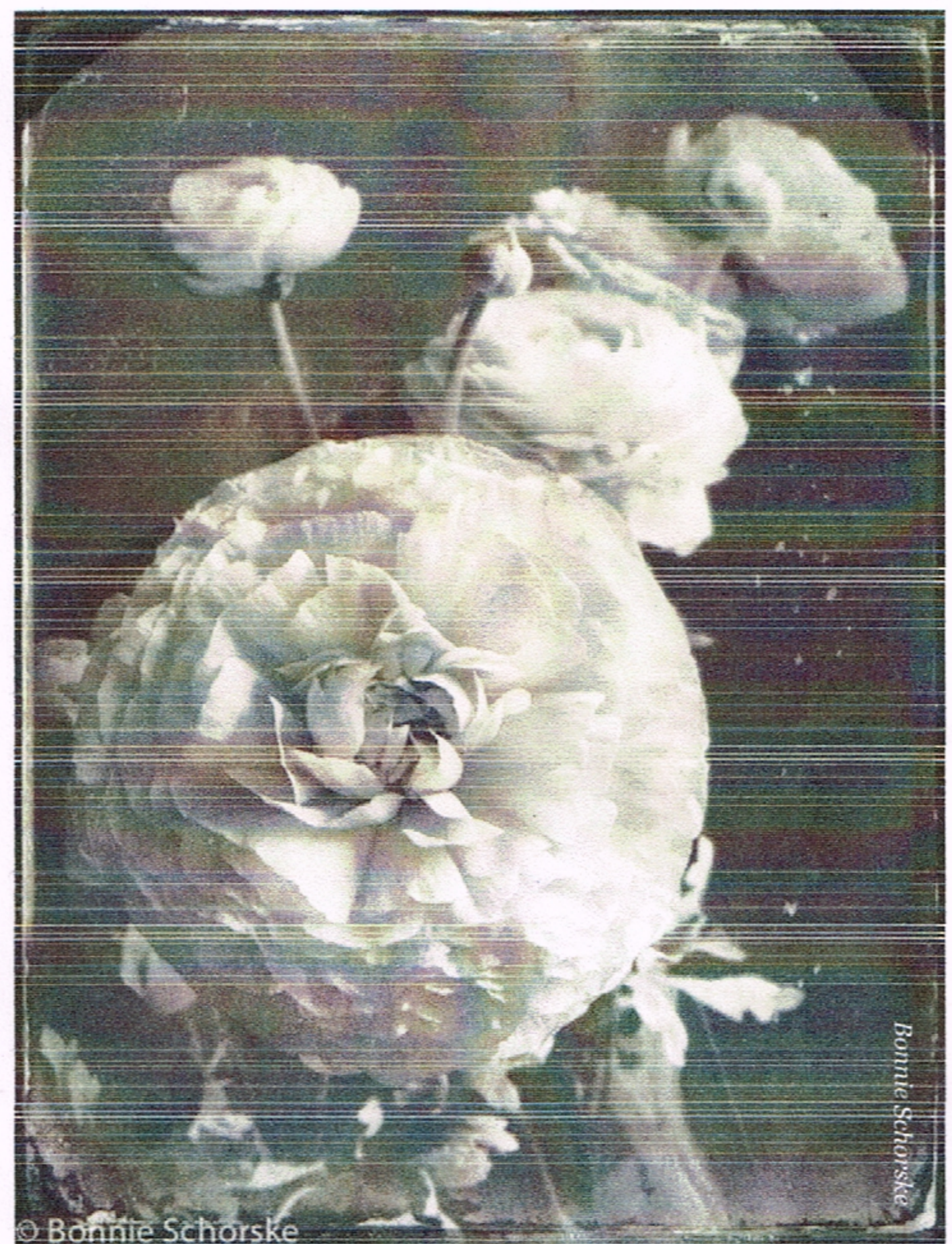
Ranunculus by Bonnie Schorske