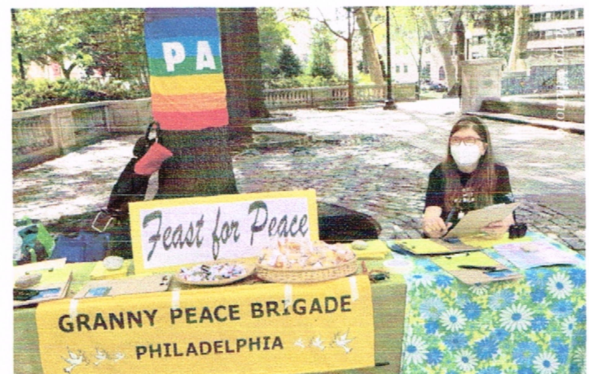
The Granny Peace Brigade celebrated Peace Day Philly and the International Day of Peace at Rittenhouse Square, along with the Philadelphia Ethical Society.

Facebook: GrannyPeaceBrigadePhiladelphia