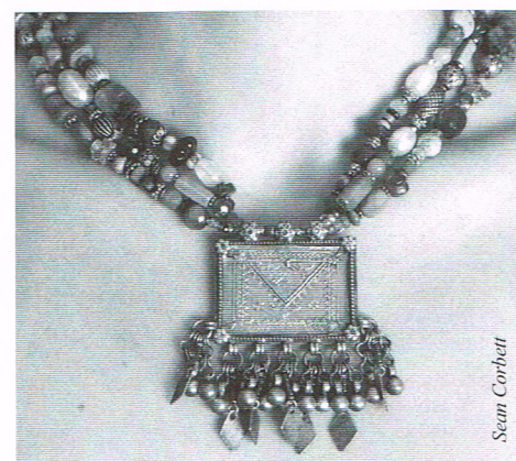
Detail of finished piece, showing a variety of materials.