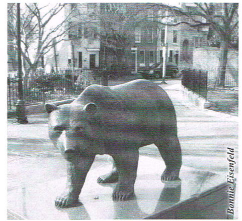
Grizzly by Eric Berg

Cret Park is a landscaped plaza on the Benjamin Franklin Parkway at 16th Street. Open seven days a week, 24 hours a day. http://www.ccdparks.org/cret-park