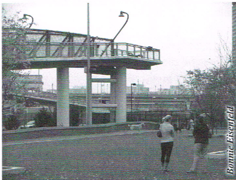
Pedestrian bridge leading to the Schuylkill Banks Boardwalk